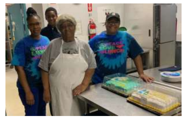
Fort Hayes Food Service team recognized by the ROTC program for their wonderful work preparing bag lunches for all this year's field trips.